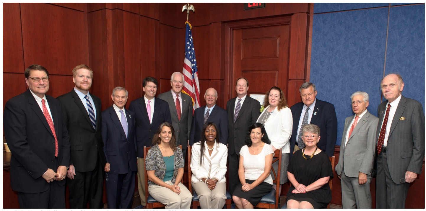
Foundation Board Members and staff gather at the annual Capitol Hill Board Meeting.