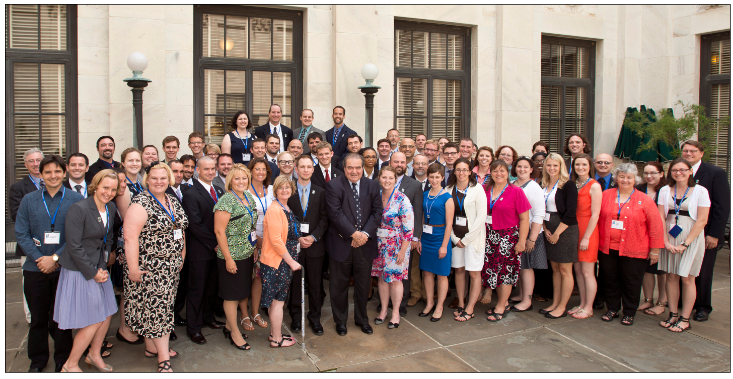
2013 Summer Institute Participants meet with Associate Supreme Court Justice Antonin Scalia.