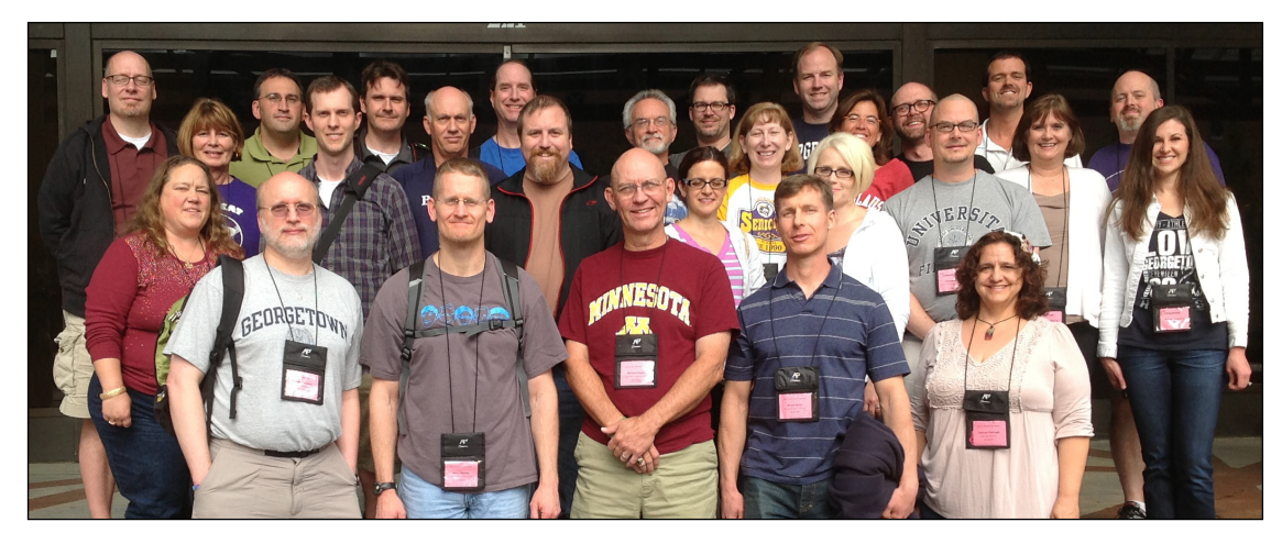
Dozens of Madison Fellows from around the nation serve each year as readers and table leaders at the Advanced Placement US History Exam scoring sessions.