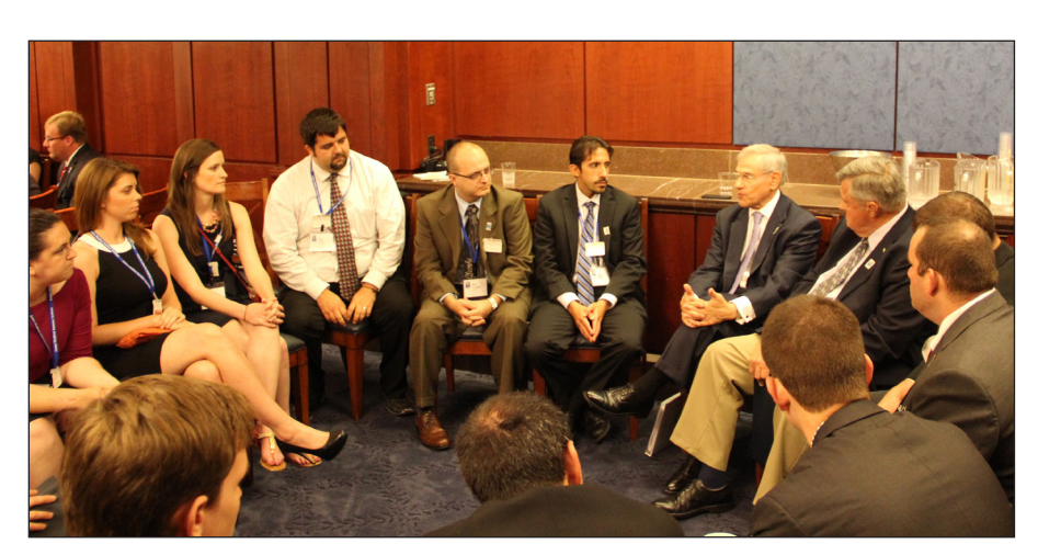
Foundation Board Members engage Fellows during informal discussion sessions held in conjunction with the annual Board meeting.

The Fellows were academically focused and worked hard during the 2013 Institute. The academic program continues to be rigorous and challenging for participants.