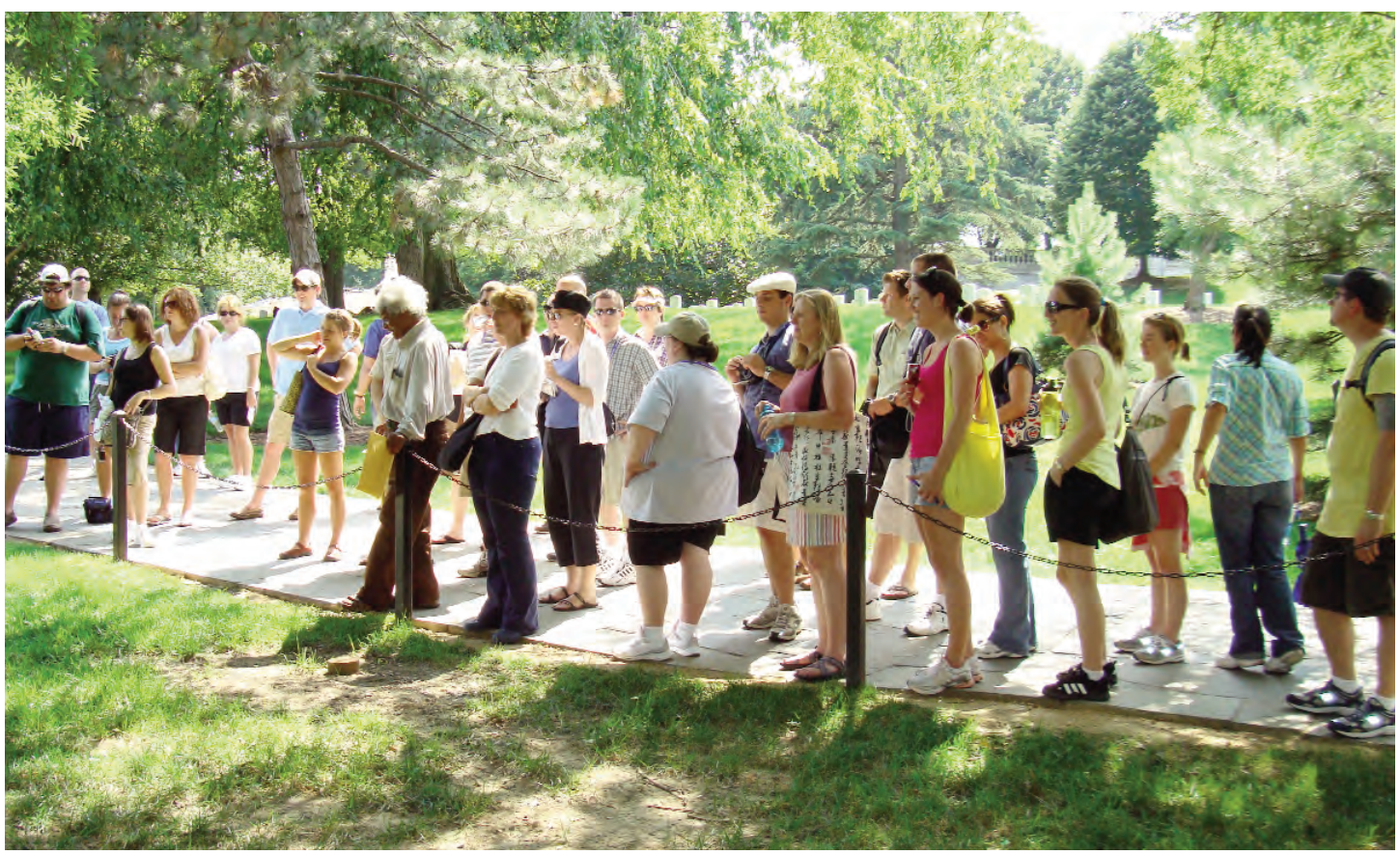
Fellows on a walking tour of Arlington National Cemetery.

The 2008 Summer Institute on the Constitution was held from June 21, 2008 to July 18, 2008. A total of 56 James Madison Fellows, representing nearly every state, attended the Institute. The Foundation invited two individuals to join the Institute, a Cuban Fellow and an Iraqi Fellow.