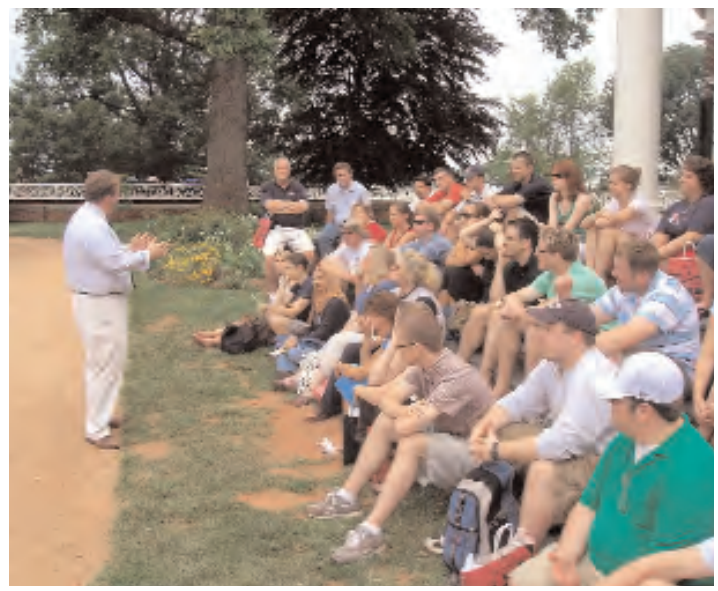
James Madison Fellows receiving a presentation at Monticello.

The Fellows were academically focused and worked hard during the 2007 Institute. The academic program continues to be rigorous and challenging for the participants. Many collegial friendships were made among the Fellows.