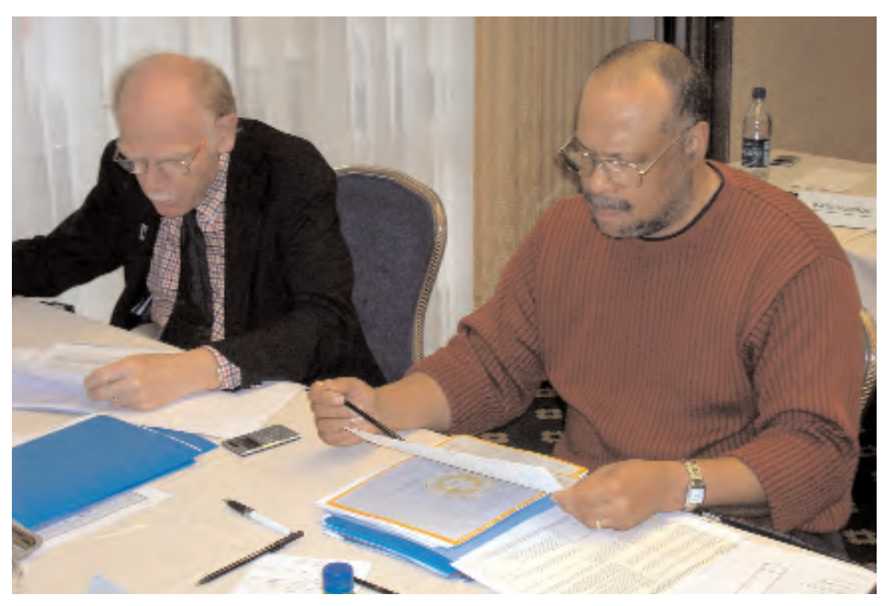
2007 Fellowship Selection Committee reading applications.