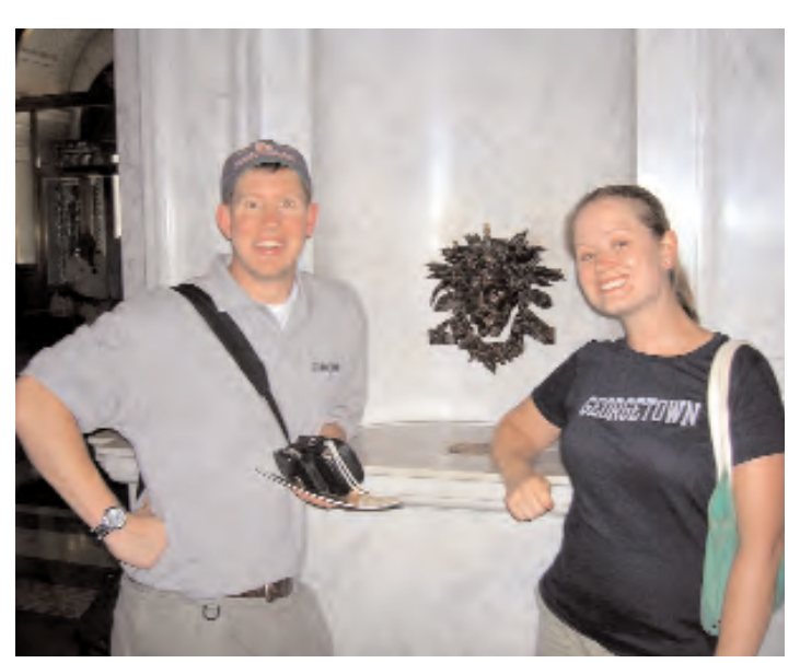
Fellows at the Library of Congress.