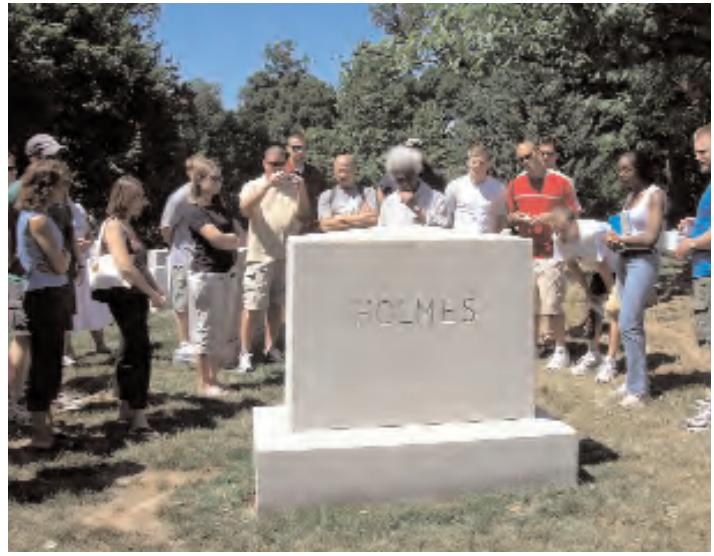
Fellows on a walking tour of Arlington National Cemetery.

The 2007 Summer Institute on the Constitution was held from June 23, 2007 to July 20, 2007. A total of 52 James Madison Fellows, representing nearly every state, attended the Institute. The Foundation invited two individuals to join the Institute, a Cuban Fellow and an Iraqi Fellow.