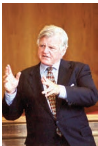
Edward M. Kennedy, Chairman, U. S. Senator, MA

The Foundation is governed by a Board of Trustees consisting of thirteen members. Twelve--two members of the Senate, two members of the House of Representatives, two members of the federal judiciary, one governor, two members of the general public and three members of the academic community--are appointed for six-year terms by the President of the United States. The Secretary of Education serves as an ex officio member. With the exception of the federal judges and the Secretary of Education, board membership is evenly divided between political parties.