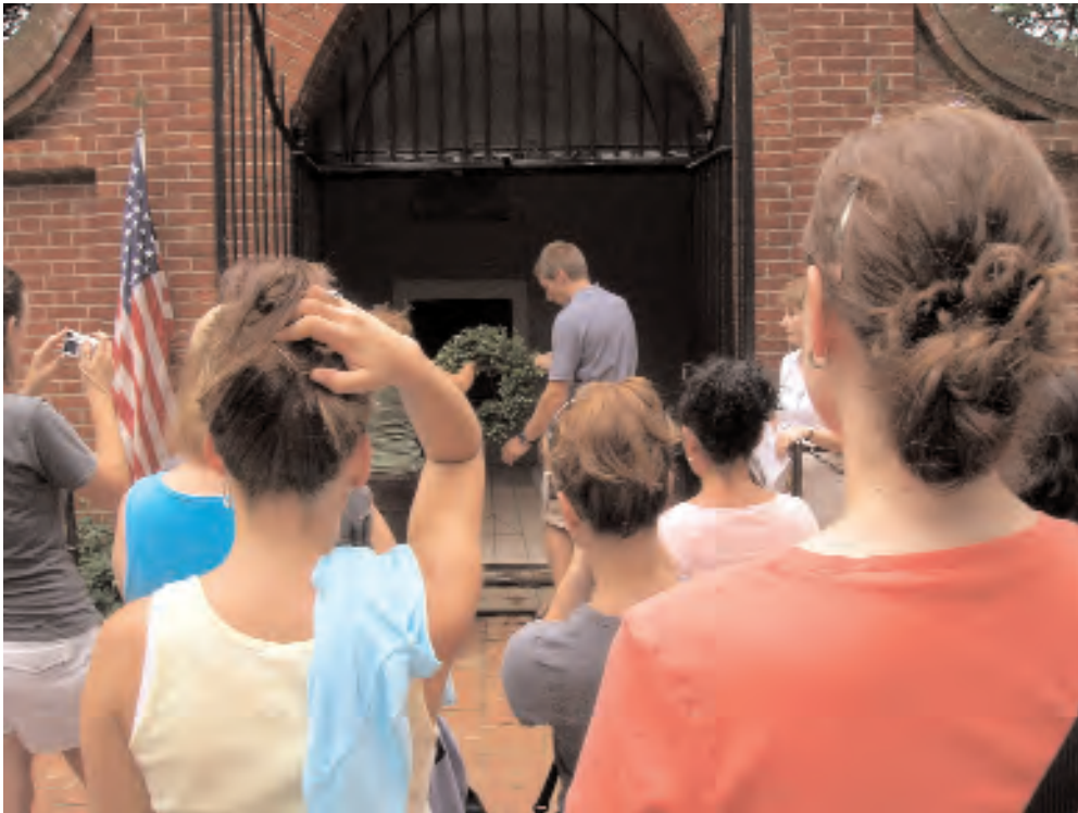
Fellows lay a wreath at the tomb of George Washington at Mt. Vernon, Virginia.