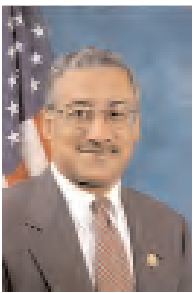
Robert Cortez Scott U.S. House of Representatives, VA