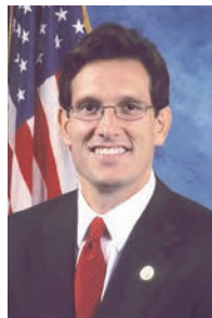
Eric Ivan Cantor, U.S. House of Representatives, VA