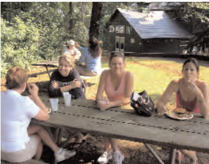
Fellows enjoying lunch during an off campus trip.

The 2006 Summer Institute on the Constitution was held from June 24, 2006 to July 21, 2006. A total of 52 James Madison Fellows, representing nearly every state, attended the Institute. The Foundation invited two individuals to join the Institute, a Cuban Fellow and an Iraqi Fellow.