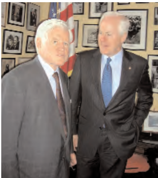
Chairman Edward M. Kennedy with newly appointed board member, Senator John Cornyn of Texas.