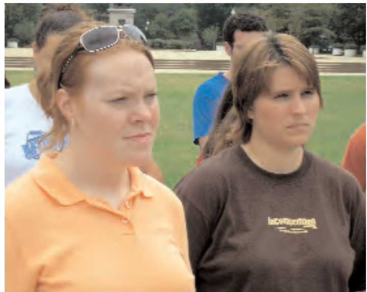
Fellows visitng historic Lincoln Park in Washington, D.C.