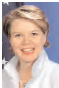
Margaret Spellings Secretary of Education Ex Officio