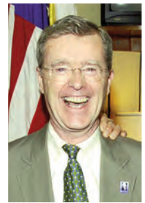
Diarmuid F. O'Scannlain, Judge, U.S. Court of Appeals, 9th Circuit