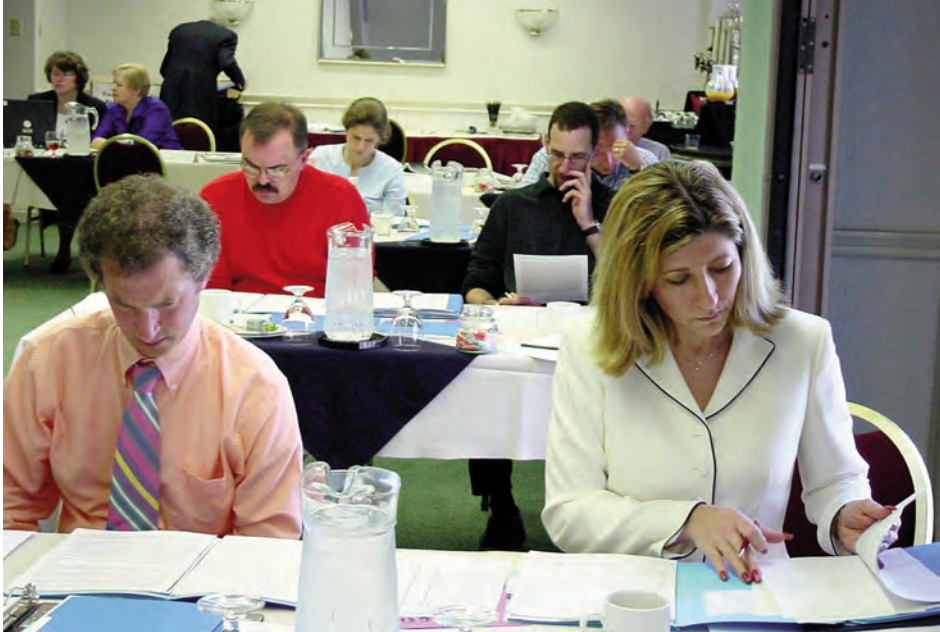
Fellowship Selection Committee reading applications.