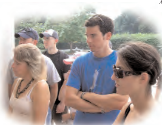
Fellows on tour of James Madison home, Montpelier.