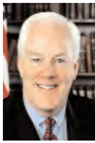
John Cornyn, U.S. Senator, TX