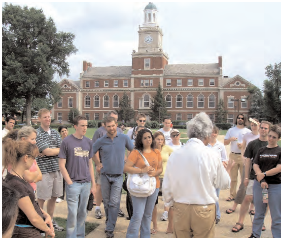
James Madison Fellows visiting the campus of Howard University in Washington, D.C.

Junior Fellowships are awarded to college seniors and graduates who wish to become secondary school teachers of American history, American government, or social studies for full-time graduate study toward a master's degree. Junior Fellows are eligible for a maxi-