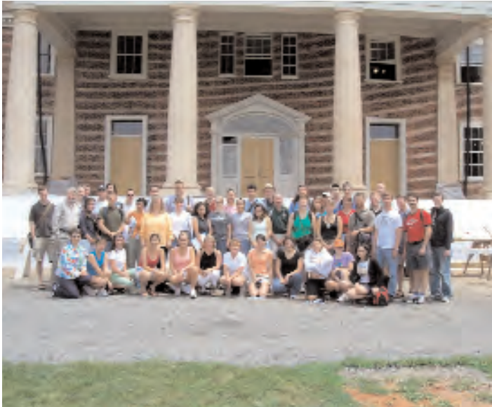
Fellows in front of the renovated facade of James Madison's Montpelier.