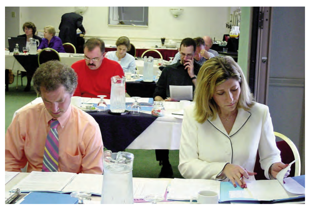
Fellowship Selection Committee reading applications