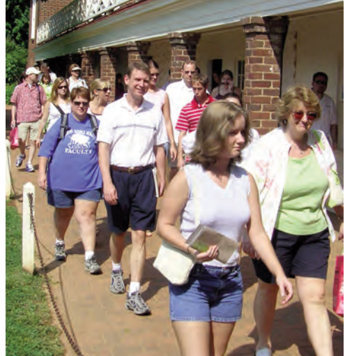
Fellows at Monticello.