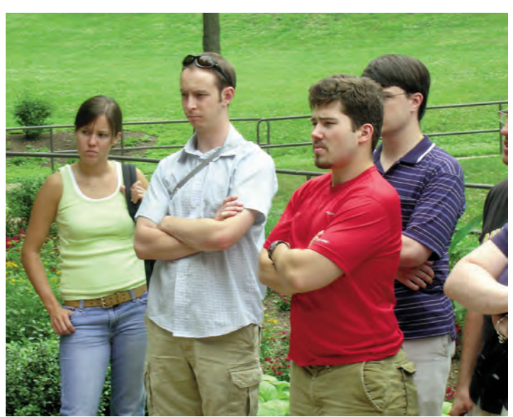
Fellows at Arlington Cemetery.