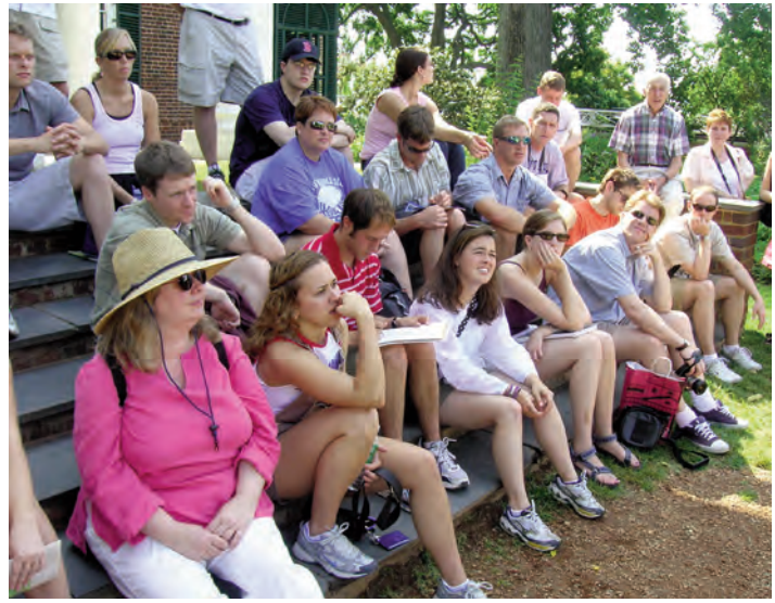
Fellows on tour at Monticello.

The 2005 Summer Institute on the Constitution was held from June 25, 2005 to July 22, 2005. A total of 52 James Madison Fellows, representing nearly every state, attended the Institute. An additional participant was a native of Havana, Cuba who is a school teacher in Florida.