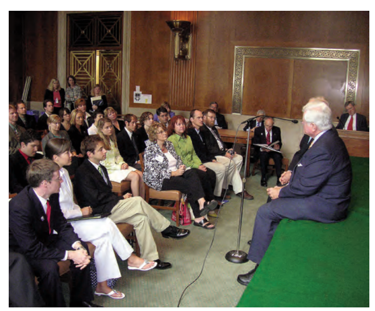
Senator Kennedy speaking to the Fellows.