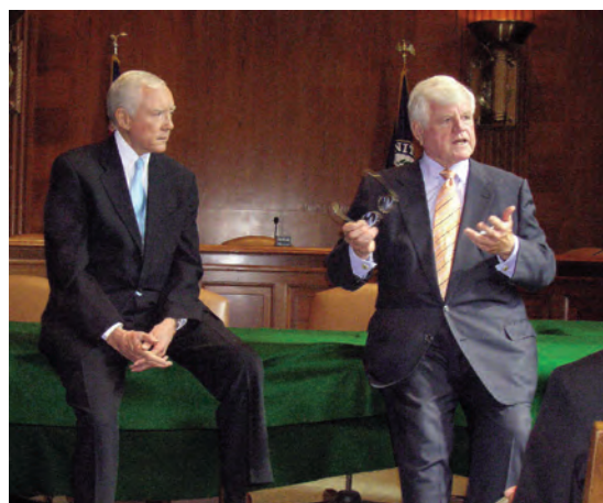
Senator Hatch and Senator Kennedy speaking to the Fellows.