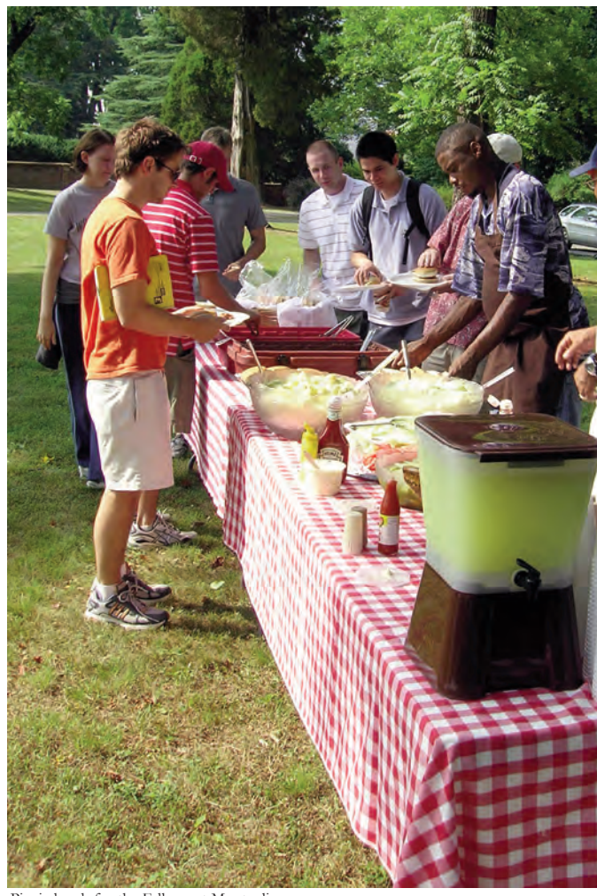
Picnic lunch for the Fellows at Montpelier.