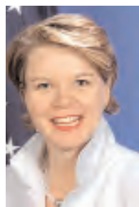
Margaret Spellings Secretary of Education Ex Officio