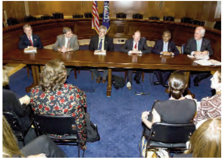
Trustees speaking with the fellows during the 2008 Trustees meeting.