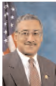
Robert Cortez Scott U.S. House of Representatives, VA