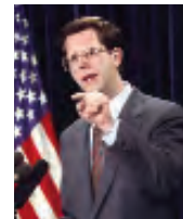
Pete Williams NBC News