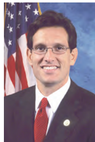
Eric Ivan Cantor, U.S. House of Representatives, VA