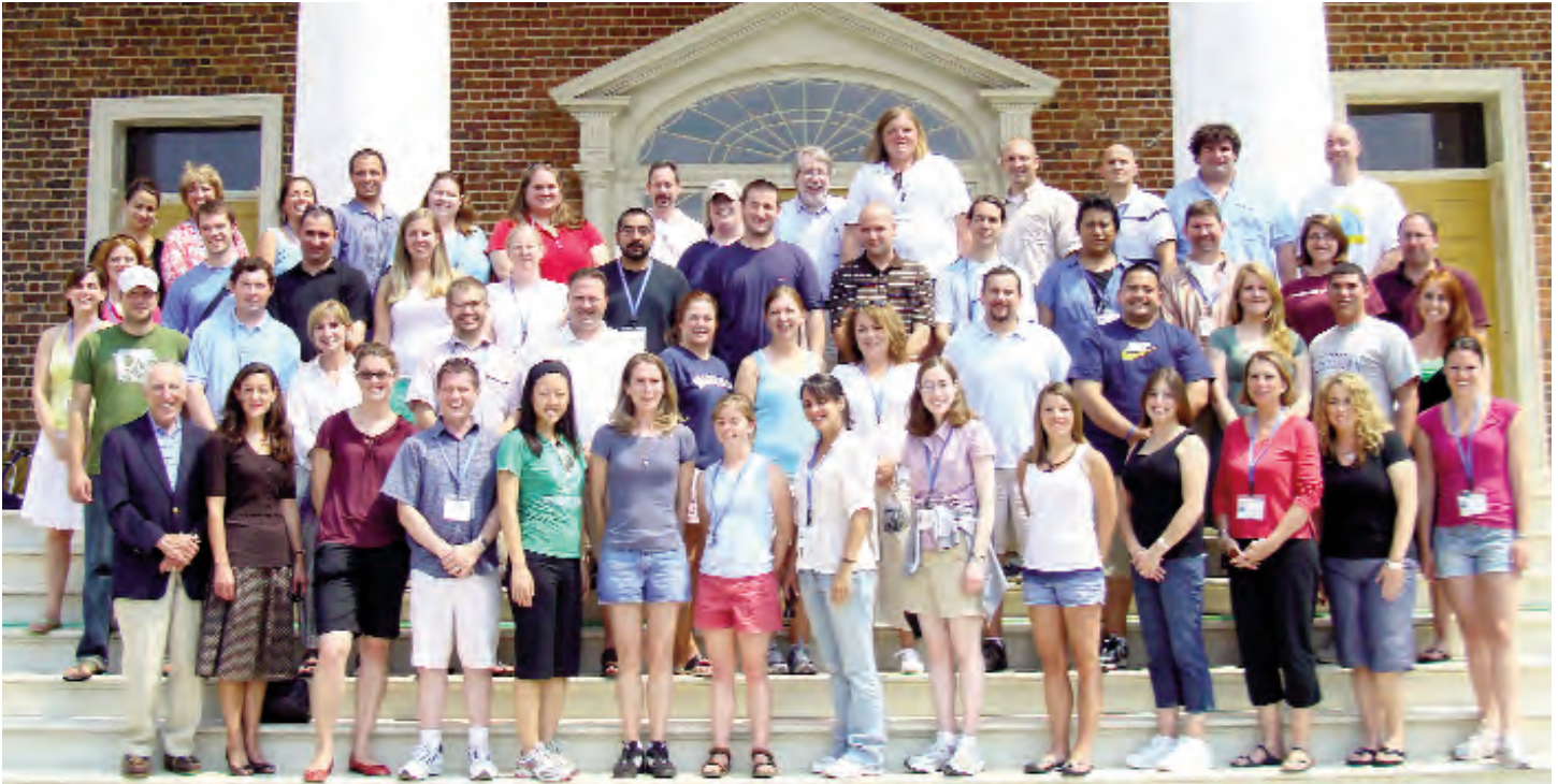
James Madison Fellows at James Madison's Montpelier.