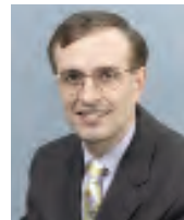
Todd Gaziano Heritage Foundation