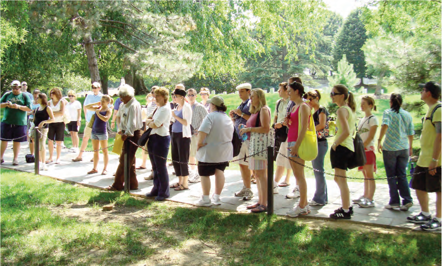
Fellows on a walking tour of Arlington National Cemetery.

The 2008 Summer Institute on the Constitution was held from June 21, 2008 to July 18, 2008. A total of 56 James Madison Fellows, representing nearly every state, attended the Institute. The Foundation invited two individuals to join the Institute, a Cuban Fellow and an Iraqi Fellow.