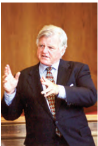
Edward M. Kennedy, Chairman, U. S. Senator, MA