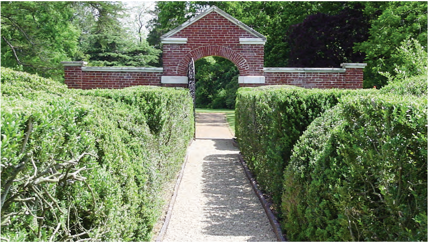
Formal Garden at James Madison's Montpelier.